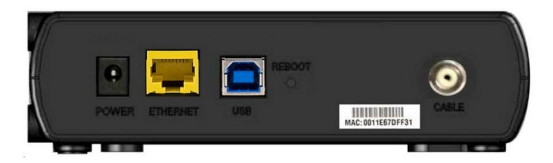
Table 2. Back Panel Features