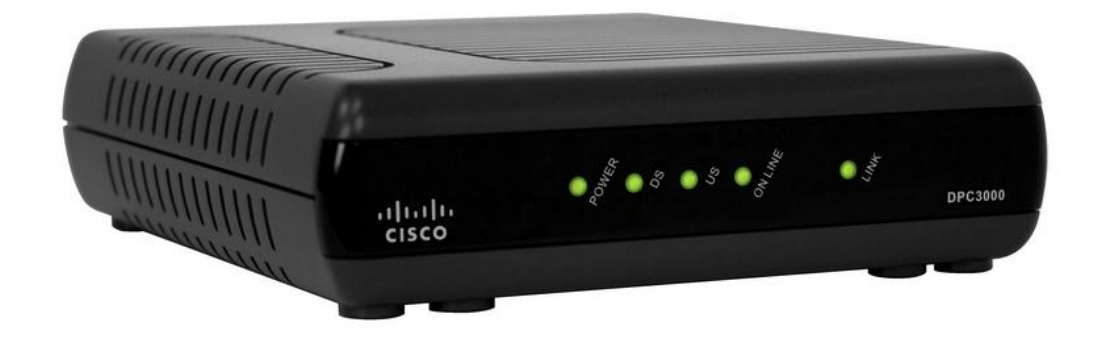
Figure 1. Cisco Model DPC3000 DOCSIS 3.0 Cable Modem

The DPC3000 is designed to meet DOCSIS 3.0 specifications as well as offering backward compatibility for operation in DOCSIS 2.0, 1.1 and 1.0 networks.